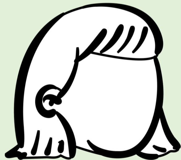
Figure 1: Human Reaction

Akanosndoqdnosdcijndcouonoainscanc.idnondc.ancon aocnosdcnautonosvovn.onodcnsoconouotnonsvo. asnoandofnmlakmsdoamd.iaoaadofnodnfosddfsd.